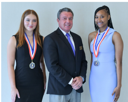
All-Alabama Academic 2024

Who’s Who Among Students in American Junior Colleges is a designation by a national organization to recognize outstanding college students. Selection for Who’s Who is through a faculty committee recommendation that is appointed by the Associate Dean of Student Affairs. Criteria for selection include academic achievement and potential contributions to the community at large, and promise of future usefulness as a citizen.