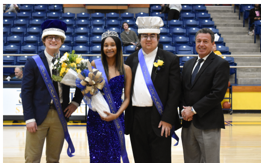
Homecoming Queen and King 2024

A female student is selected by popular vote of the student population to receive this honor at the annual homecoming basketball game. Qualifications and guidelines are specified in the SGA Constitution.