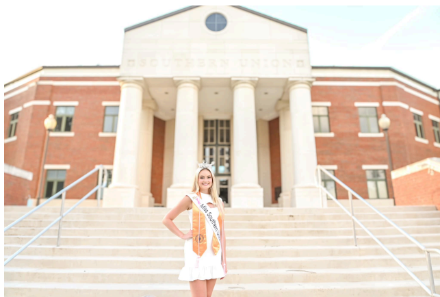
Miss Southern Union 2024

To assist students with career decisions, a collection of current resource materials on careers, occupations, and undergraduate programs at other universities is located in the campus academic advising offices and the learning resource centers. Additional information is available on the college's webpage here .