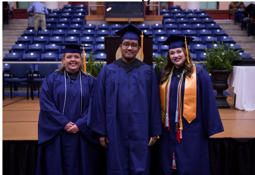
Most Outstanding Students 2024

Three students, one each from the academic, technical, and health sciences divisions, are chosen annually by faculty committees representing each division and recognized at the spring graduation for their demonstrated academic record and leadership skills. The most outstanding academic student is designated as the James B. Allen scholar. The late Honorable James B. Allen, United States Senator from Alabama, established the award to recognize a student with outstanding “character, leadership, scholarship, citizenship, and sportsmanship.”