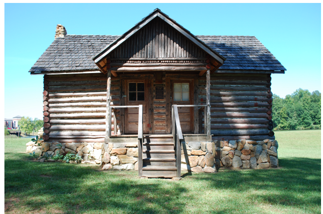
Southern Union Log Cabin, Wadley Campus