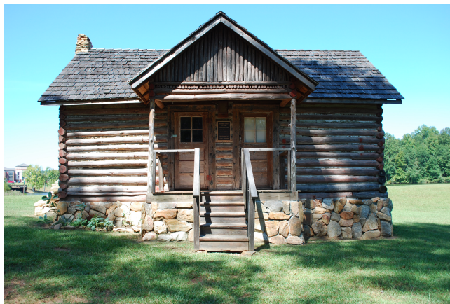
Southern Union Log Cabin, Wadley Campus