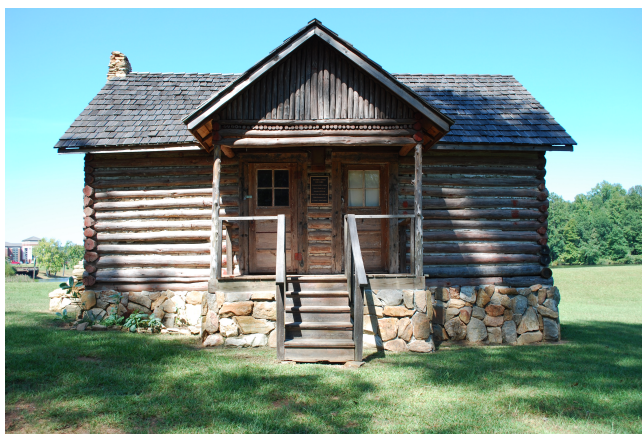
Southern Union Log Cabin, Wadley Campus